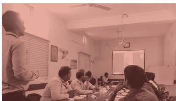
Review of MTs