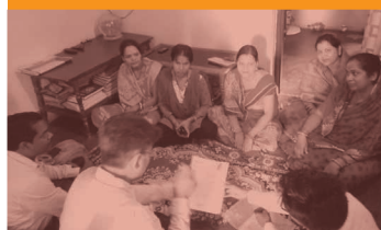
Shriram City Union Finance