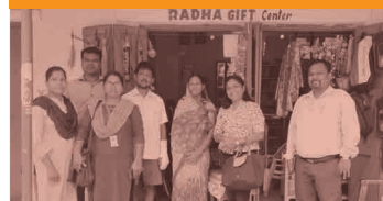
BOPA Pte. Ltd