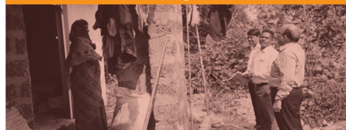
Easy Home Finance